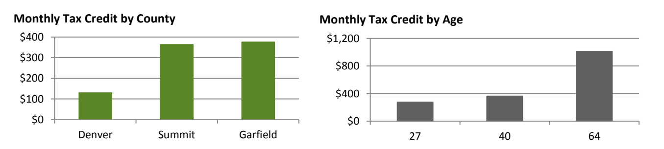
Figure 1. Tax credits by geography and age<sup>3</sup>

Because tax credits are calculated based upon the premiums of plans that are uniquely available to each individual or family, tax credits vary significantly based on geography and age. For example, a 40-year-old nonsmoker living in Denver who makes approximately $23,000 per year will receive a $129 per month tax credit while the same individual living in Summit County will receive a $363 per month tax credit. A 64-year-old nonsmoker in Summit County with an income of nearly $23,000 per year will receive more than 3.5 times the tax credit of a similar 27-year-old. Figure 1 illustrates these examples, showing how tax credits vary based on geography and age.