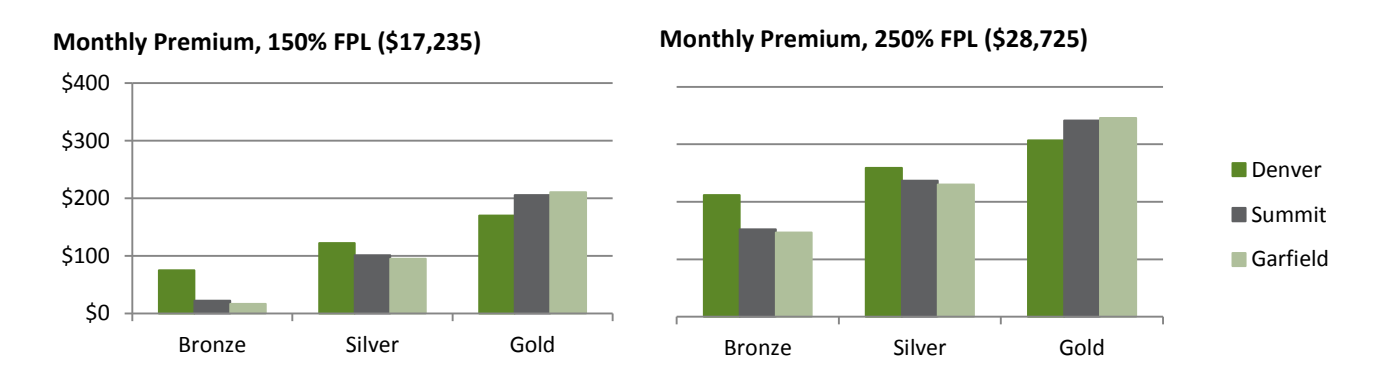
Figure 2. Average monthly premium after tax credits for 27-year-old nonsmoker by income level

For older individuals, the average premiums for silver and bronze plans after tax credits remain lower in Summit and Garfield even at higher income levels. For example, Silver and Bronze plans are less expensive for a 40-year-old nonsmoker in Summit and Garfield counties until that individual makes more than $34,470 per year (300 percent FPL). For a 64-year-old nonsmoker with an income of $45,960 per year (400 percent FPL), the average cost of a bronze plan in Garfield County is $182 less per month than in Denver. Silver plans in Garfield for this same individual are, on average, $78 less per month than in Denver. Figure 3 shows that 64-year-olds at all income levels eligible for tax credits through the exchange will pay less for silver and bronze plans than they would if they lived in Denver.