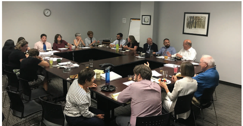
Our staff and our Board of Directors discussed CCLP's work during a summer retreat.