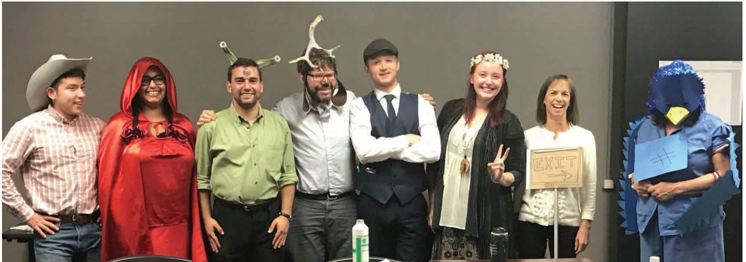
Proving that policy wonks can have fun, CCLP's staff dressed up for a Halloween costume-party/potluck celebration last October.