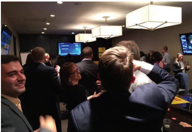
The CCLP team cheered on election night as results came in for Amendment 70, the ballot initiative that raised Colorado's minimum wage.