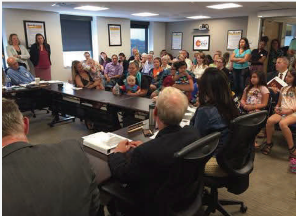
On July 6, dozens of parents who use the Colorado Works program testified in front of Colorado's Human Services Board to support a proposal to raise basic cash assistance for the first time in 10 years. Approved by a 6-2 vote, CCLP and its advocacy partners worked diligently to make the proposal a success.

CCI and county government representatives agreed that an increase in cash assistance was justified, but they believed the